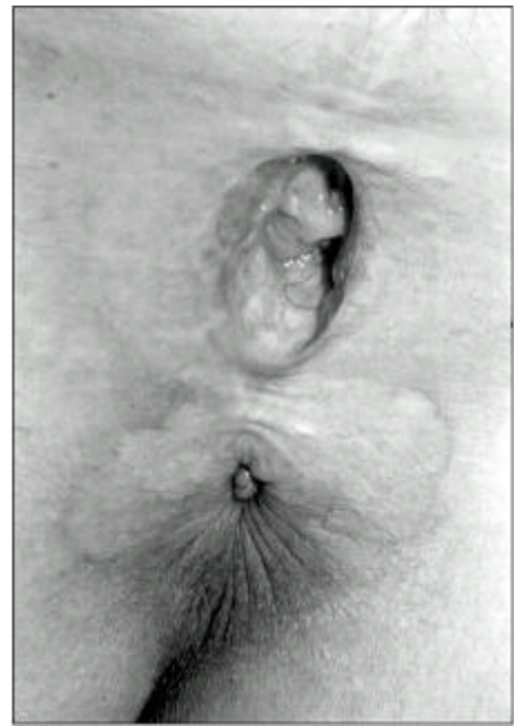
Fig. 2. Patient with perianal Paget's disease. A well-demarcated pale eczematoid lesion measuring 6.5×3.5 cm is seen around the anus.