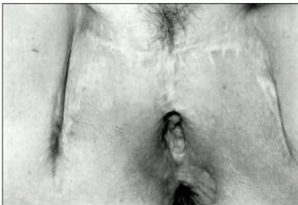
Fig. 1. Patient with perianal Paget's disease. The previous operative scar (wide vulvectomy with skin flap) is seen on the perineum.