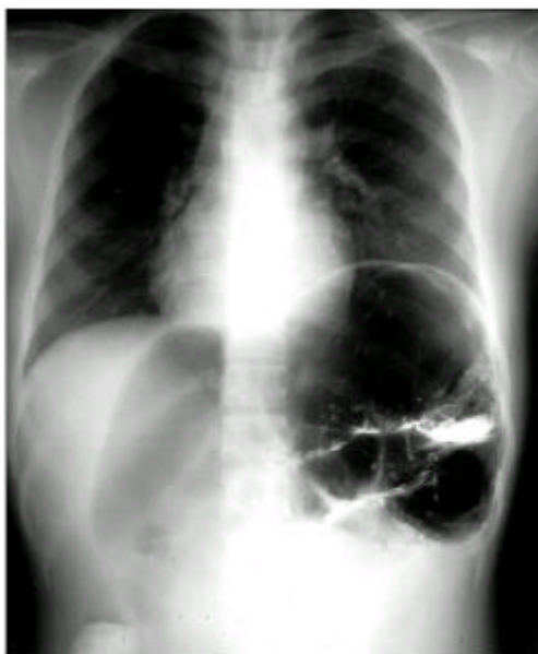
Fig. 1. Chest radiography findings. Elevation of left hemidia- phragm due to marked dilatation of splenic flexure of colon is noted.