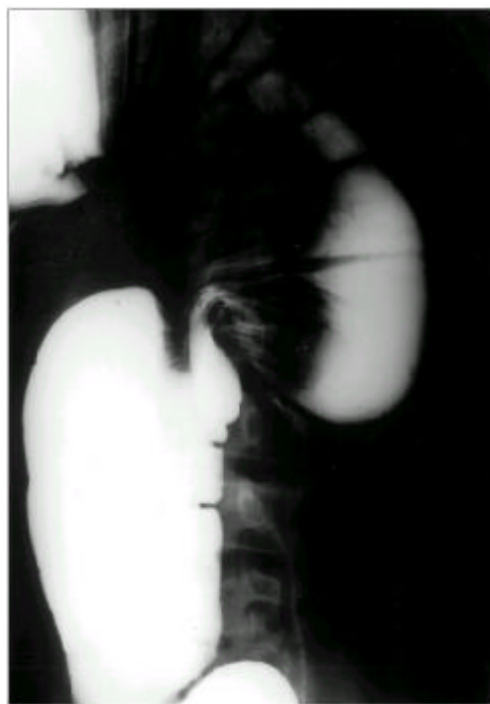
Fig. 3. Marked dilatation of proximal colonic loop due to sigmoid volvulus is noted on follow up barium enema.