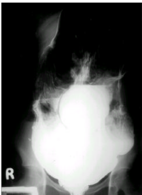
Fig. 2. Marked dilatation of colon is observed on barium enema.