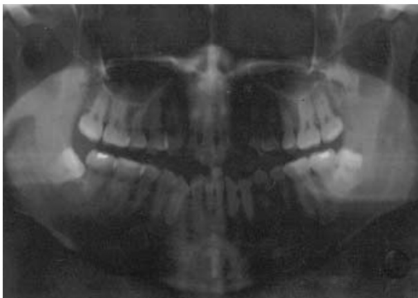
Fig. 1. There is no remarkable bony resorption around left lower third molar in panoramic X-ray view.

The JOC is considered to be an embryonic structure, which suggests that it might be a vestigial salivary gland tissue or incidentally-included epithelium determined and incised by the direction of growth and the fusion of the maxillary and mandibular processes. 2 It is a strand of epithelium that appears in a 10- to 12-week-old embryo as a nodular thickening at the lateral border of the sulcus buccalis. 1 The JOC grows with the developing embryo, forming well-defined epithelial nests lying close to