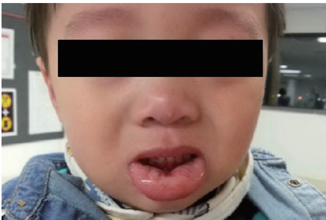
Fig. 2. Extraoral photograph showing lip swelling.