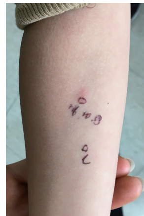
Fig. 3. Skin prick test with saline (C) and lidocaine.

mL of 2% lidocaine hydrochloride with 1 : 100,000 epinephrine (2% Lidocaine HCl · Epinephrine Inj., Yuhan). The right lower first primary molar was restored with resin after indirect pulp capping, while the left lower first primary molar was restored with a glass ionomer. The patient's condition was checked after treatment and before he returned home.