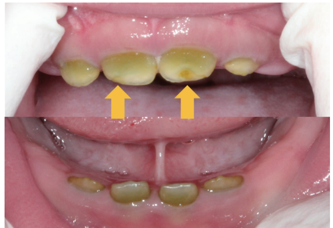
Fig. 3. Green discoloration on the primary upper and lower incisors in a 16-month-old boy. Upper central incisors showed enamel hypoplasia (yellow arrow).

The patient was born by Cesarean section due to an amnion rupture after 26 weeks and 6 days of gestation, weighing 930 g. The patient suffered from severe bronchial pulmonary dysplasia. The patient received ligation of patent ductus arteriosus