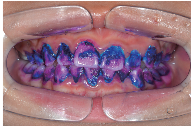
Fig. 2. The tooth-surfaces were changed to pink or red, blue or purple, and light blue.