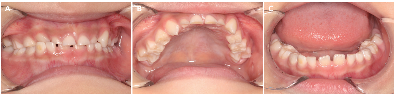
Fig. 2. Intraoral view of the 1st case. At the age of 6 years, both maxillary permanent canines are fully erupted and the right permanent canine formed a crossbite with the mandibular primary canine (A-C).