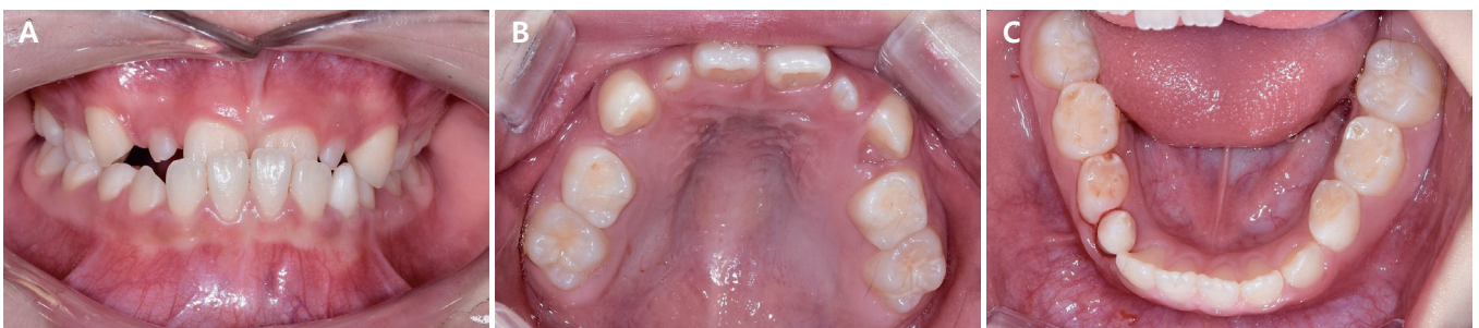
Fig. 4. Intraoral view of the 2nd case. At her 1-year follow-up check, at the age of 7 years, both maxillary permanent canines are fully erupted (A-C).