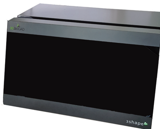
Fig. 2. 3D dental scanner used in this study.

at a rate of 8.3°C/min and maintained for 2 hours, followed by oven-cooling to room temperature. 10 specimens were prepared for each thickness and divided into 2 subgroups for 2 types of cement. Thus, each subgroup comprised 5 specimens. The interiors of the crowns produced for this study and the Nu-smile zirconia crowns were filled with 2 shades of Rely-X U200 Automix (3M/ESPE, Neuss, Germany): translucent (TR) and A2 shade. In accordance with the manufacturer's instructions, the crown was filled with cement using an automatic mixing syringe from the incisal tip to a slight overflow, taking care to avoid producing air bubbles. Light curing was carried out using VALO (Ultradent Products, South Jordan, UT, USA) light curing unit at an intensity of 1000 mW/cm 2 for 20 seconds on each labial and lingual surface, and excess cement was removed (Fig. 3A, 3B)