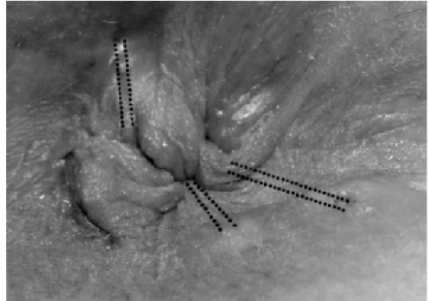
Fig. 3. A photograph of the perineum with patient in right lateral position, showing three independent fistulas, indicated by double dotted lines. During operation, the three internal openings were found at 2 o'clock, 6 o'clock and 8 o'clock.